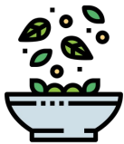
Lemon Garlic Salad 72 Cal

Ingredients: 1/4 lb Ground Beef (113 g) 1/8 cup Water (30 g) 1/4 cup Sour Cream (60 g) 1 cup shredded Iceberg Lettuce (36 g) 1/4 cup, shredded Cheddar Cheese (28 g) 1/4 cup, chopped or sliced Tomato (45 g) 1/4 tsp Hot Sauce (1 g) optional - 1/4 pinch Cayenne Pepper (0 g) optional - 1/4 tsp Paprika (1 g) optional - 1/2 tbsp Chili Powder (4 g)