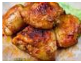
Pan-Roasted Chicken Thighs 773 Cal