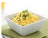
Basic scrambled eggs 358 Cal

358 Calories • 1g Carbs (0g Fiber) • 30g Fat • 20g Protein