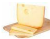
Cheese 378 Cal

378 Calories • 1g Carbs (0g Fiber) • 31g Fat • 23g Protein