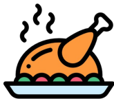
Bacon Chicken Balls 749 Cal

824 Calories • 12g Carbs (4g Fiber) • 64g Fat • 53g Protein