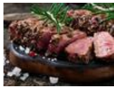
Beef Tenderloin in Herbed Salt Crust 566 Cal

Ingredients: 3/4 tbsp Olive Oil (11 g) 6 oz Beef Tenderloin (170 g) 1/4 cup Water (59 g) optional - 1 tsp Salt (6 g) optional - 1/2 tbsp Rosemary (1 g) optional - 1 tsp Black Pepper (2 g)