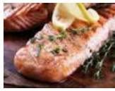
Baked Lemon Thyme Salmon 726 Cal

Ingredients: 1/2 lemon Lemon zest (2 g) 2 tbsp Olive Oil (28 g) 8 oz Salmon (227 g) 1 medium stalk Green Onion (15 g) optional - 1/2 tbsp Thyme (1 g) optional - 1 dash Black Pepper (0 g) optional - 1 dash Salt (0 g)