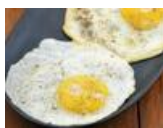
Sunny-Side-Up Eggs 137 Cal